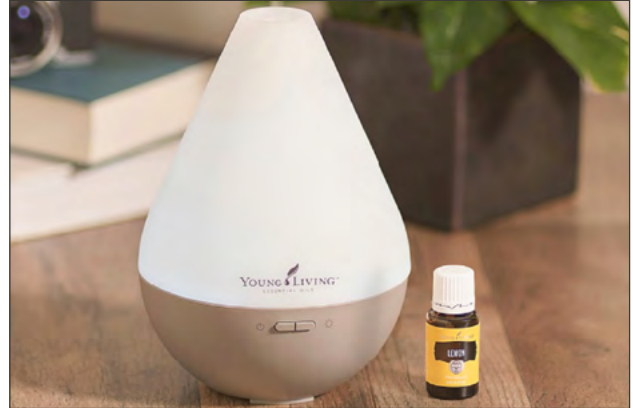
RESPIRA BIENESTAR BASIC STARTER KIT PRICE: ₡39.990 | PV: 44.25