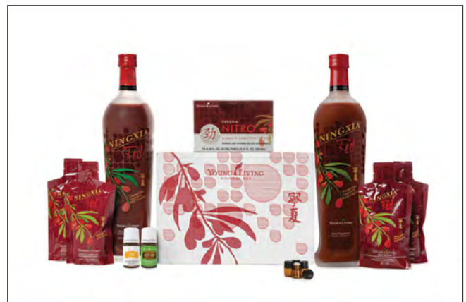
NINGXIA PREMIUM STARTER KIT PRICE: ₡92,200 | PV: 100