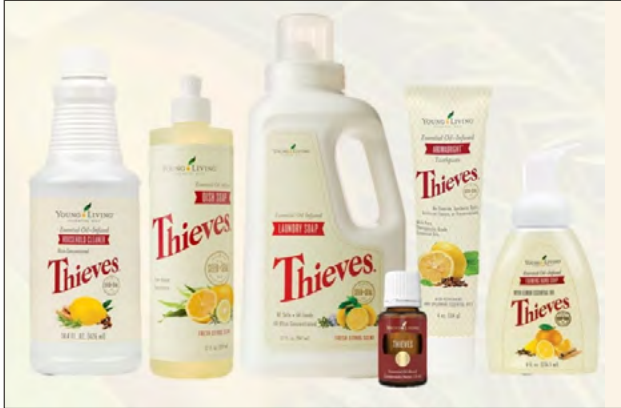
THIEVES PREMIUM STARTER KIT PRICE: ₡71.100 | PV: 100