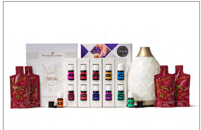
PREMIUM STARTER KIT WITH DESERT MIST DIFFUSER PRICE: ₡98,140 | PV: 100