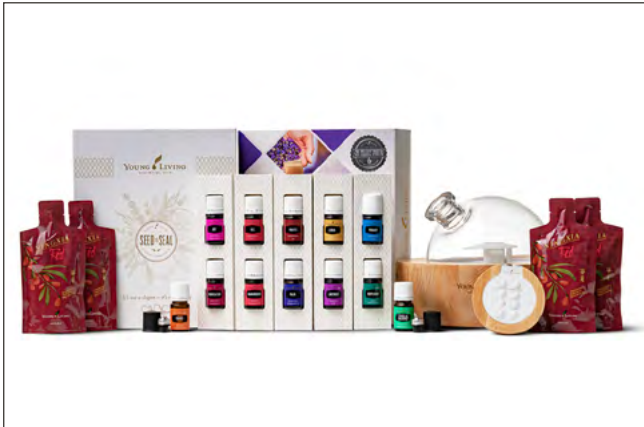
PREMIUM STARTER KIT WITH ARIA DIFFUSER PRICE: ₡154,650 | PV: 100