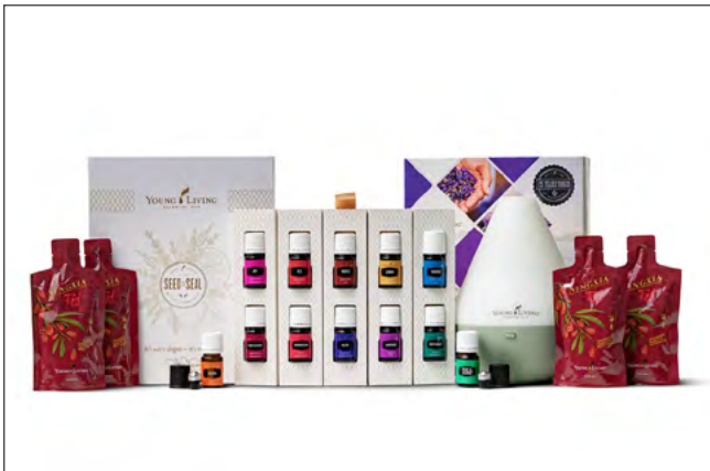
PREMIUM STARTER KIT WITH DEWDROP DIFFUSER PRICE: ₡98,140 | PV: 100