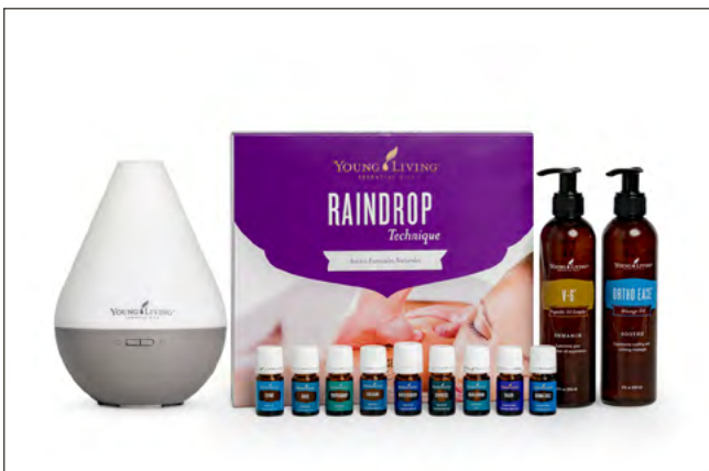
RAINDROP PREMIUM STARTER KIT WITH DEWDROP DIFFUSER PRICE: ₡101.120 | PV: 100