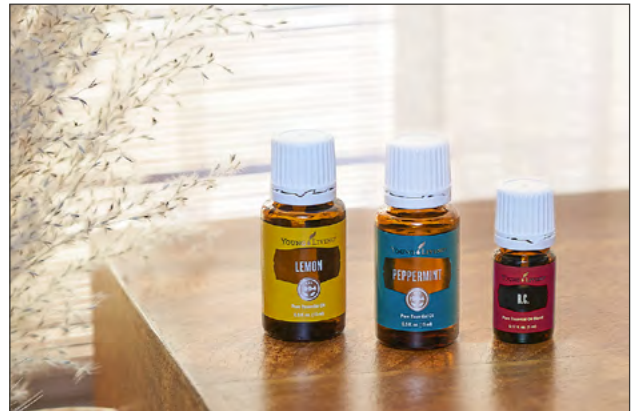
INHALA FRESCURA BASIC STARTER KIT PRICE: ₡27.910 | PV: 44