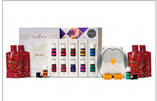
PREMIUM STARTER KIT WITH FEATHER THE OWL DIFFUSER PRICE: ₡92,200 | PV: 100