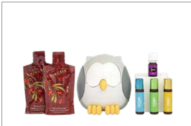
KIDSCENTS PREMIUM STARTER KIT PRICE: $169.40 | PV: 100 | SKU: 42215