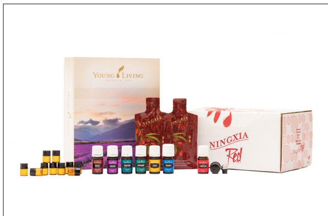
PREMIUM STARTER KIT WITH NINGXIA RED SINGLES PRICE: $169.40 | PV: 100 | SKU: 565161