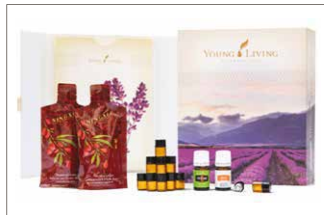
BASIC STARTER KIT PRICE: $52.36 | SKU: 546061