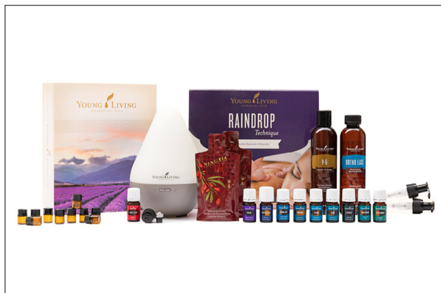
PREMIUM STARTER KIT WITH RAINDROP AND DEWDROP DIFFUSER PRICE: $169.40 | PV: 100 | SKU: 24083