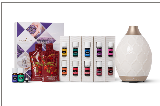
PREMIUM STARTER KIT WITH DESERT MIST DIFFUSER PRICE: $169.40 | PV: 100 | SKU: 29764