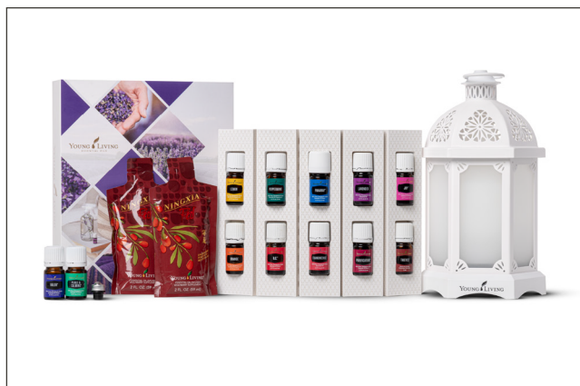
PREMIUM STARTER KIT WITH LANTERN DIFFUSER PRICE: $181.16 | PV: 100 | SKU: 32012