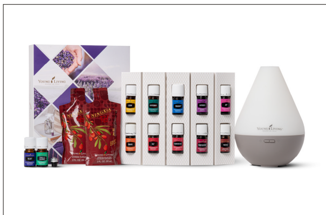
PREMIUM STARTER KIT WITH DEWDROP DIFFUSER PRICE: $169.40 | PV: 100 | SKU: 29760