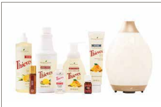
THIEVES PREMIUM STARTER KIT WITH DESERT MIST DIFFUSER PRICE: $169.40 | PV: 100 | SKU: 37486