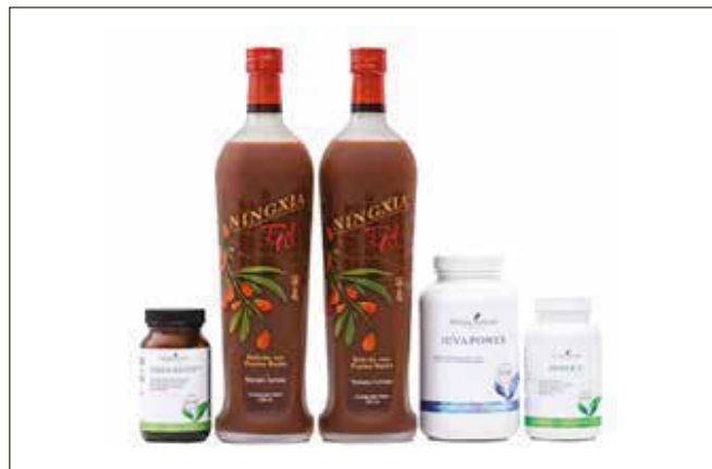
NUTRITIONAL PREMIUM STARTER KIT PRICE: $181.16 | PV: 100 | SKU: 38263