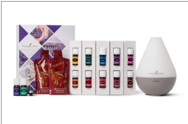
PREMIUM STARTER KIT WITH DEWDROP DIFFUSER PRICE: $178.25 | PV: 100 | SKU: 29760