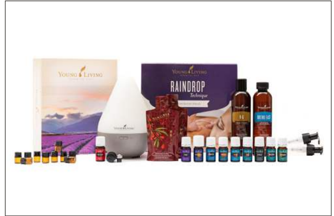
PREMIUM STARTER KIT WITH RAINDROP AND DEWDROP DIFFUSER PRICE: $178.25 | PV: 100 | SKU: 24083