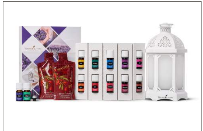
PREMIUM STARTER KIT WITH LANTERN DIFFUSER PRICE: $190.61 | PV: 100 | SKU: 32012