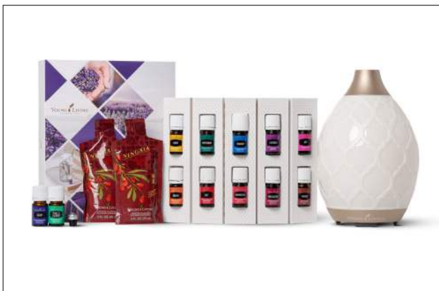
PREMIUM STARTER KIT WITH DESERT MIST DIFFUSER PRICE: $178.25 | PV: 100 | SKU: 29764