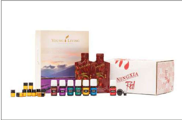
PREMIUM STARTER KIT WITH NINGXIA RED SINGLES PRICE: $178.25 | PV: 100 | SKU: 565161