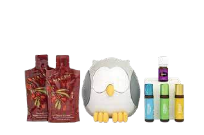
KIDSCENTS PREMIUM STARTER KIT PRICE: $178.25 | PV: 100 | SKU: 42215