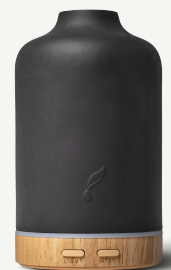
Ember diffuser 36040