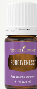
Forgiveness 5ml 33639