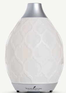
Desert mist diffuser 28645