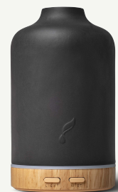
Ember diffuser 36040