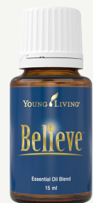
Believe 15ml 466138