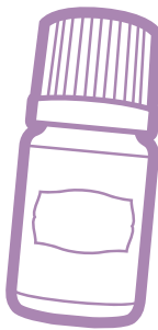
1支17PV以上的精油 > 17PV Essential Oil