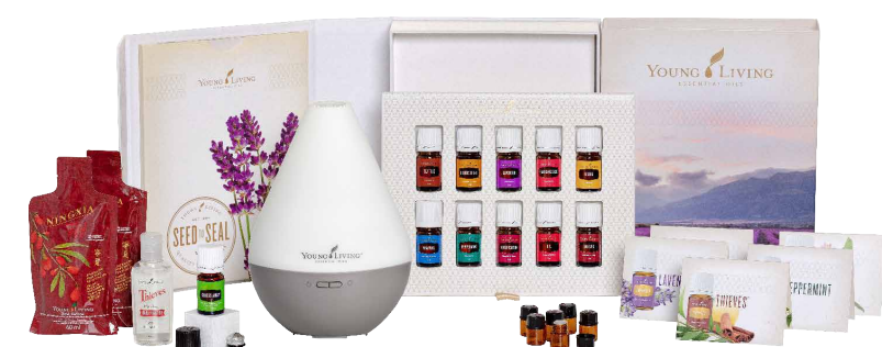
高級入門套裝(配水滴型擴香機) Premium Starter Kit with Dew Drop Diffuser