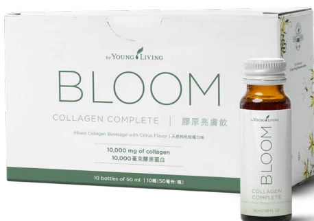
膠原亮膚飲 X3 Bloom Collagen