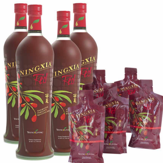
寧夏紅基本獎勵產品套裝 NingXia Red® Essential Rewards Kit

Recommended Combinations of 300PV Orders