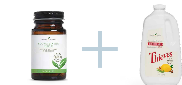
營養補充品 (Life 9)+ 盜賊家居清潔液補充裝 Supplement (Life 9) + Thieves Household Cleaner 1.8L