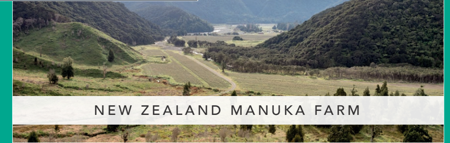
NEW ZEALAND MANUKA FARM